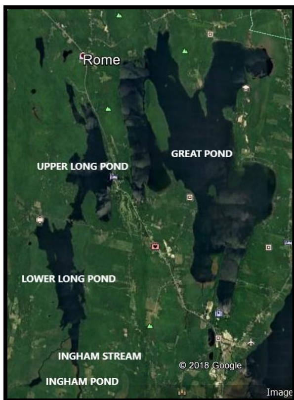
Figure 1. The Belgrade Lakes Study Area.