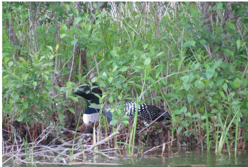
Figure 2. Nesting Loons, Ram Island, Great Pond.